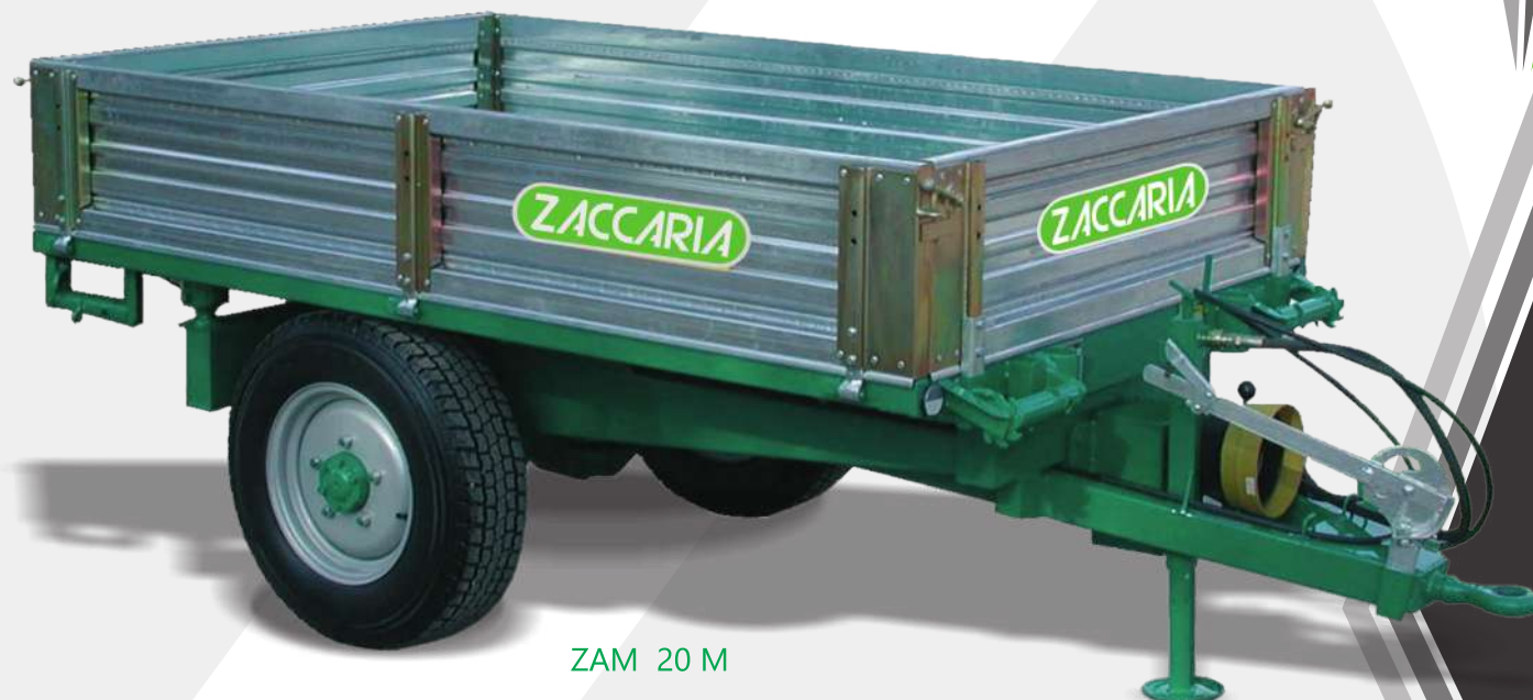
ZAM 20 M

Front bar for wood. Galvanized toolbox. Hydraulic brake. Poles for logs 1,50 mt. Extension sides. Tubes for lateral or rear poles (inside the trailer body).