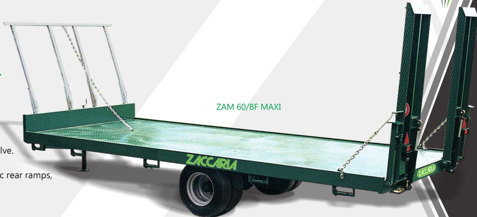
ZAM 60/BF MAXI