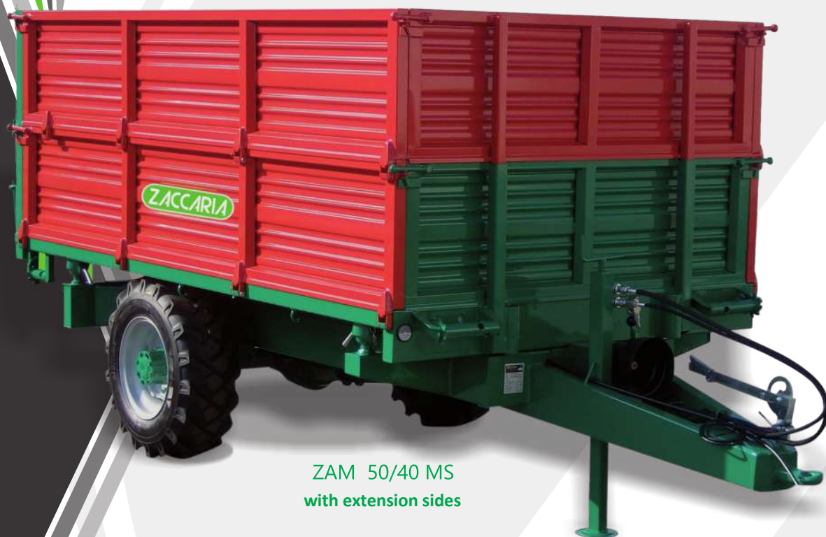
ZAM 50/40 MS with extension sides