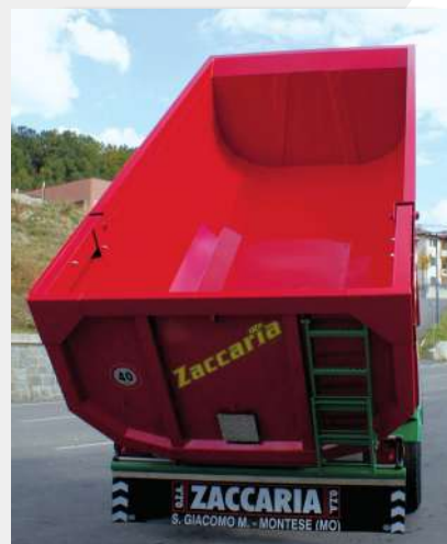
ZAM 70 DPN

Rear opening for cereals dumping. Manual PVC covering. Brake control approved device for tractor without trailer brake valve. Hydraulic parking stand. 550/45-22,5 Flotation new tires. Rear tipping operated by gear pump and PTO shaft. Lateral extension sides H 20 cm. Reinforced body for soil and inert loading. Inner food painting.