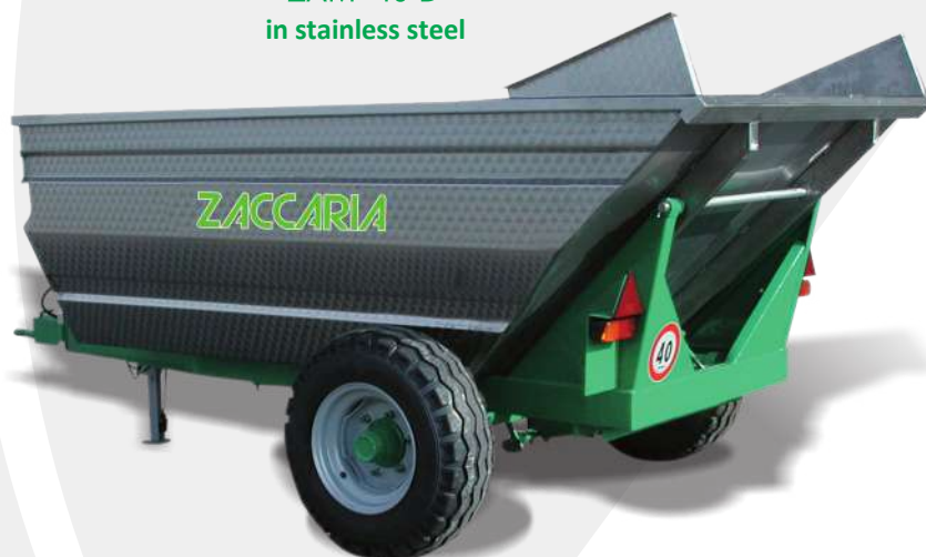
ZAM 40 D in stainless steel

Brake control approved device for tractor without trailer brake valve on ZAM 50 D Super model. Hydraulic brake on ZAM 25 D/40 D models. Extension sides H 40 cm (Front and lateral). Rear extension side H 40 cm. Inner food painting. Body galvanization. Extension galvanization. Stainless steel body.