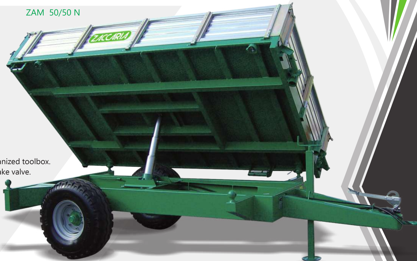
ZAM 50/50 N

Downwards/upwards opening of the lateral sides. Front bar for wood. Rear opening for cereal dumping. Galvanized toolbox. Brake control approved device for tractor without trailer brake valve. Hydraulic brake. Poles for logs 1,50 mt. Hydraulic parking stand. Mechanical iron ramps (payload 4 Tons). Special gearbox for the connection to 2 different tractors. Net extension sides H 80 cm. Extension sides. Aluminium sides and extension sides. Comas sides. Tubes for lateral or rear poles (inside the trailer body).