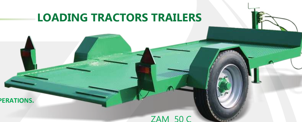
ZAM 50 C

THE TRAILER IS EQUIPPED WITH A REAR LITTLE SLIDE THAT FACILITATES THE LOADING OPERATIONS. A REAR SIDE IS NOT NECESSARY TO LOAD MACHINES ON THE TRAILER.