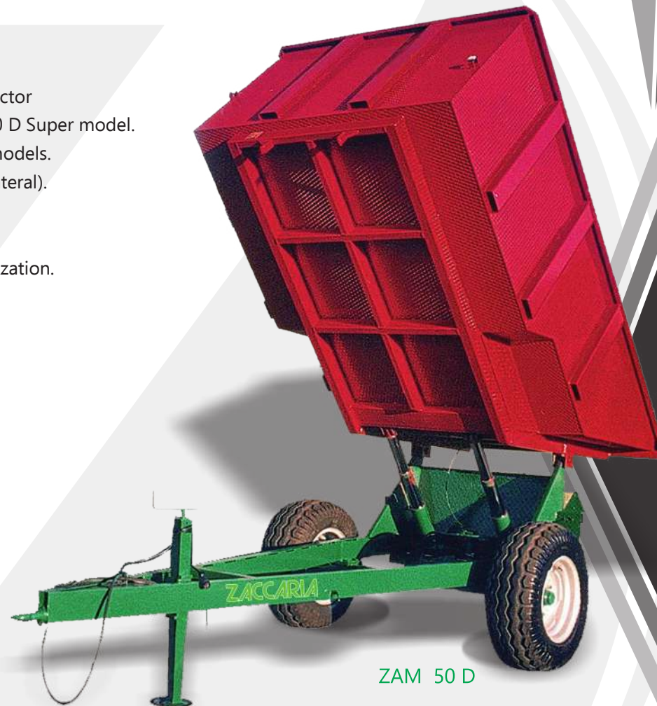
ZAM 50 D