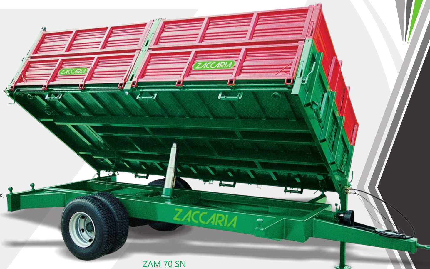
ZAM 70 SN with aluminium sides and industrial columns