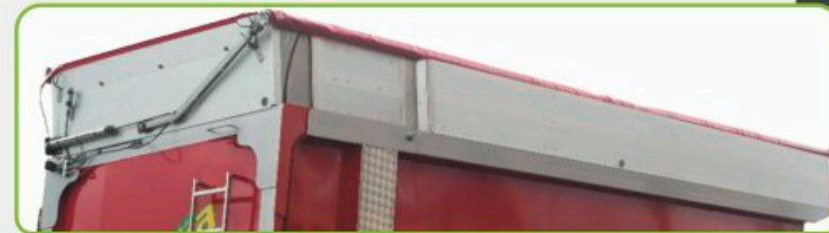
Alluminium extension sides with pneumatic PVC cover