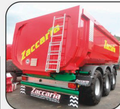
Hydraulic watertight rear door